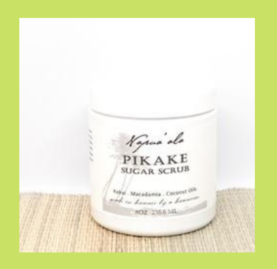
Pikake Sugar Scrub PISG8 $12.50 PER PIECE

Kukui, Macadamia, and Coconut Oils, along with organic sugar, leaves your skin feeling smooth, soft, and amazing, but never oily.