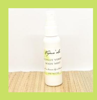
Coconut Verbena Body Mist COBM2 $5.50 PER PIECE