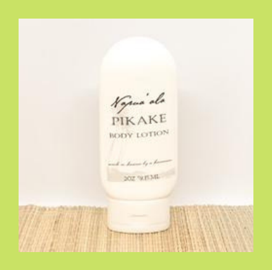
Pikake Body Lotion PIBL2 $5.50 PER PIECE

The first ingredient is Aloe Vera along with Shea Butter, Jojoba Oil, and Vitamin E, to name a few. A momgreasy lotion that leaves skin felling moisturized.