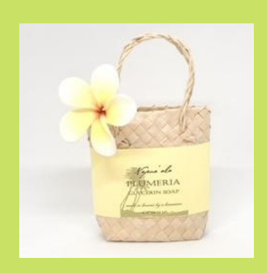
Plumeria Glycerin Soap PLSP $5.50 PER PIECE