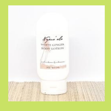
White Ginger Body Lotion WHBL2 $5.50 PER PIECE