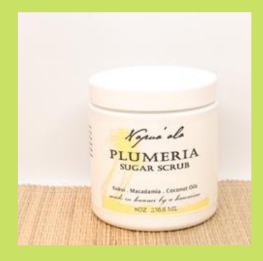
Plumeria Sugar Scrub PLSG8 $12.50 PER PIECE