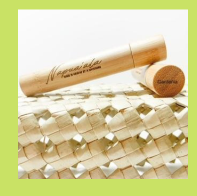
Gardenia Bamboo Roll-on GABR $10.00 PIECE