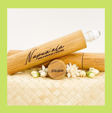
Pikake Bamboo Roll-on PIBR $10.00 PER PIECE

A Roll-on made with a high percentage of unique blended scents, making the roller perfume grade. Enjoy longer-lasting Hawaiian aroma. the glass roller packaged beautifully in a bamboo tube, great for travel or take along.