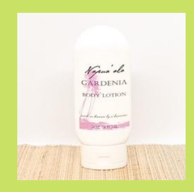
Gardenia Body Lotion GABL2 $5.50 PER PIECE