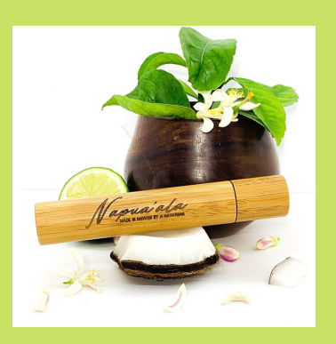
Coconut Verbena Bamboo Roll-on COBR $10.00 PER PIECE