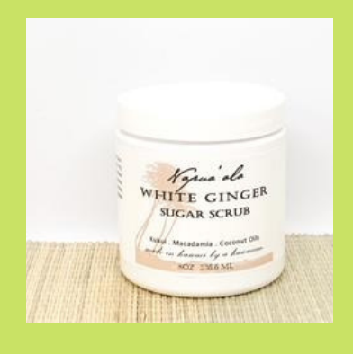
White Ginger Sugar Scrub WHSG8 $12.50 PER PIECE