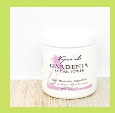
Gardena Sugar Scrub GASG8 $12.50 PER PIECE