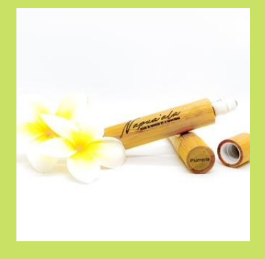
Plumeria Bamboo Roll-on PLBR $10.00 PER PIECE