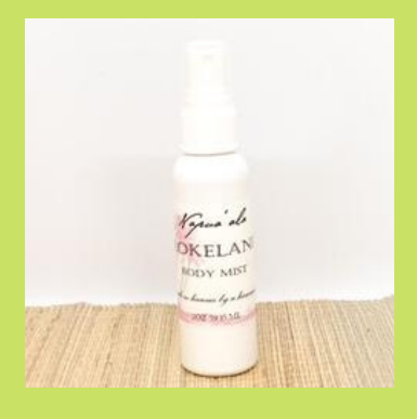
Lokelani Body Mist LOBM2 $5.50 PER PIECE