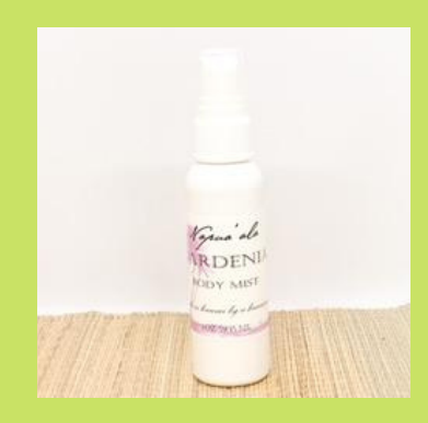
Garenia Body Mist GABM2 $5.50 PER PIECE