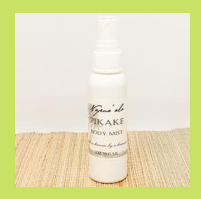
Pikake Body Mist PIBM2 $5.50 PER PIECE

Add a light mist after a shower for a delicate fragrance. Or mist in the air to add scent to any room.