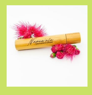
Lokelani Bamboo Roll-on LOBR $10.00 PER PIECE