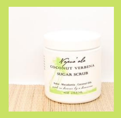
Coconut Verbena Sugar Scrub COSG8 $12.50 PER PIECE