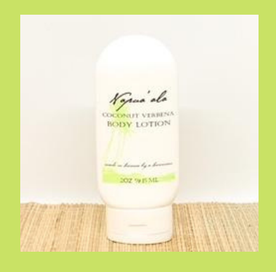
Coconut Verbena Body Lotion COBL2 $5.50 PER PIECE