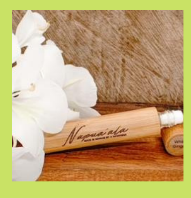
White Ginger Bamboo Roll-on WHBR $10.00 PER PIECE