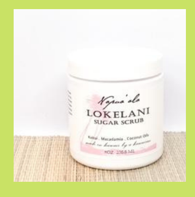
Lokelani Sugar Scrub LOSG8 $12.50 PER PIECE