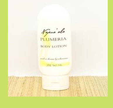
Plumeria Body Lotion PLBL2 $5.50 PER PIECE