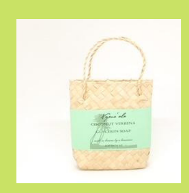
Coconut Verbena Glycerin Soap COSP $5.50 PER PIECE