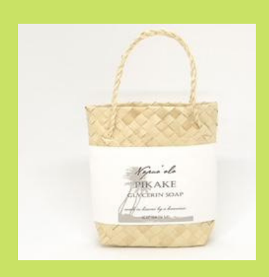
Pikake Glycerin Soap PISP $5.50 PER PIECE

4oz glycerin, with added ground oats (Colloidal), makes for a moisturizing bar. Burry bags are handwoven just for Napua'ala, which makes for perfect packaging and gift giving. *Size of bag and handles may vary.