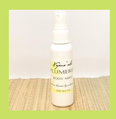
Plumeria Body Mist PLBM2 $5.50 PER PIECE