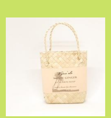
White Ginger Glycerin Soap WHSP $5.50 PER PIECE