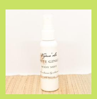
White Ginger Body Mist WGBM2 $5.50 PER PIECE