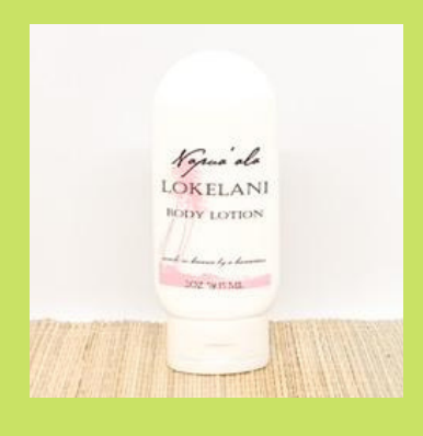
Lokelani Body Lotion LOBL2 $5.50 PER PIECE