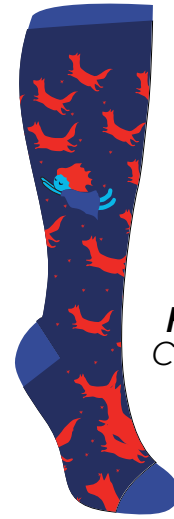
Hit RECoRD Custom Socks